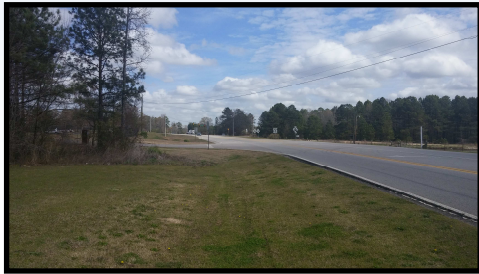
Road view toward Thomson By-pass