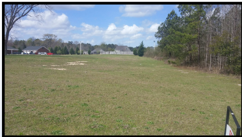
Additional view of lot