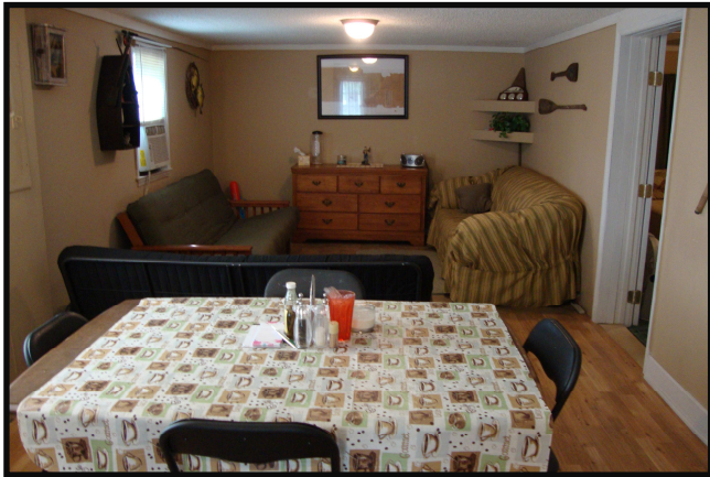
Dining Area and Den