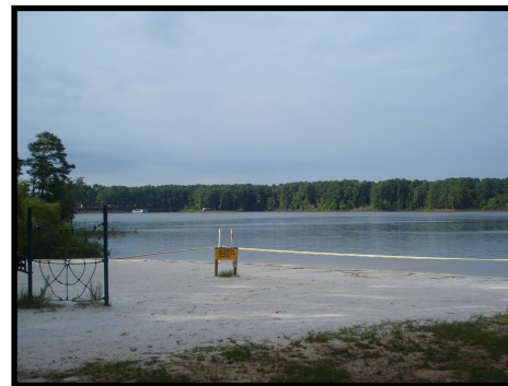
About 2 miles to Amity Recreation Area - with nice beaches and picnic areas

(The above data, although believed to be accurate, is not guaranteed by the listing company.)