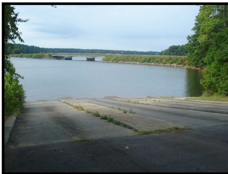
About 2 miles to Amity Recreation Area—Boat Ramp

From I-20 Exit 172 go north on GA Hwy 17 for 2 miles, turn right onto GA Hwy 43 toward Lincolnton for 5.5 miles. Take left onto Coxville Road. House is on right 300 feet from Hwy 43.