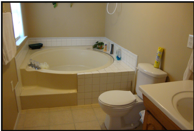
Owner's Bath with large garden tub