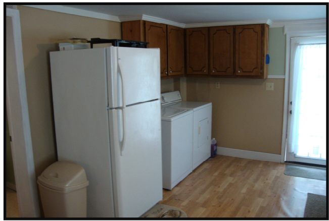
Additional view of the Kitchen