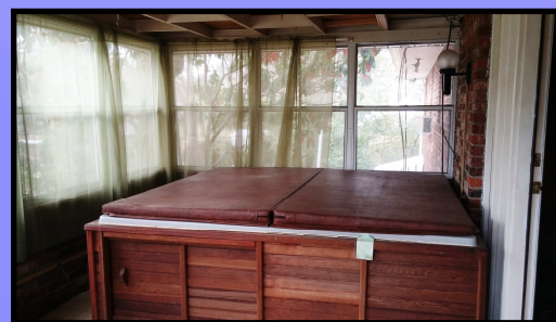
Hot Tub in the Sun Room

(The above data, although believed to be accurate, is not guaranteed by the listing company.)