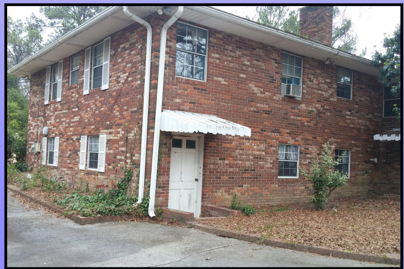
Back of Home

(The above data, although believed to be accurate, is not guaranteed by the listing company.)