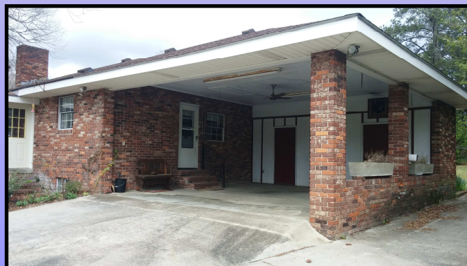
Double rear entry Carport

Deed Book 6L page 15 Tax Parcel # W17 009 & # W17 007 Plat Book I, page 190 2016 Taxes $ 3,032