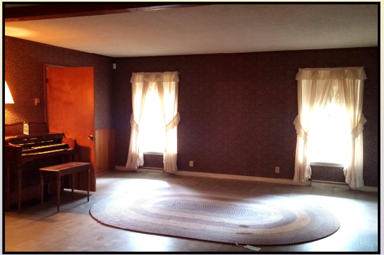
Additional view of Great Room