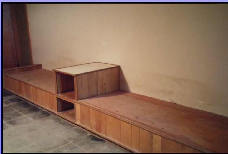
Den area with built in sofa/cots