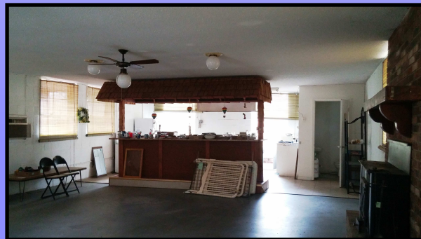
Inside of Cook house

(The above data, although believed to be accurate, is not guaranteed by the listing company.)