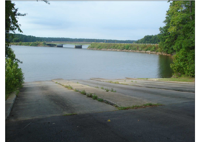
About 2 miles to Amity Recreation Area—with nice beaches and picnic areas