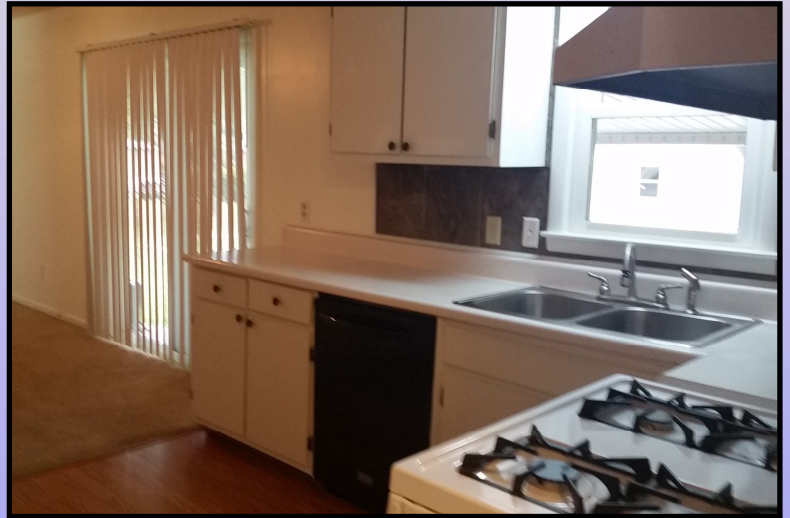
Additional view of Kitchen