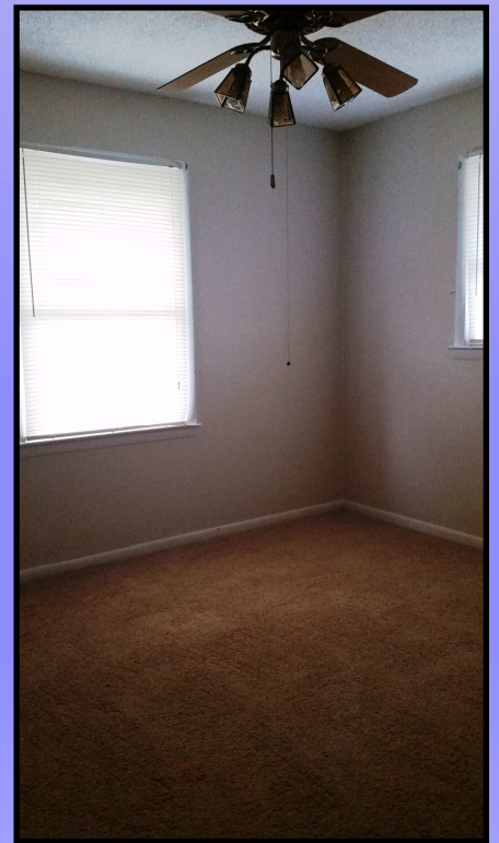
Bedroom # 3