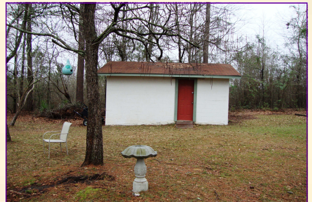
16' x 20' Workshop