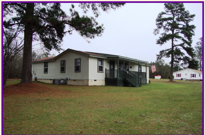
Additional view of home

(The above data, although believed to be accurate, is not guaranteed by the listing company.)