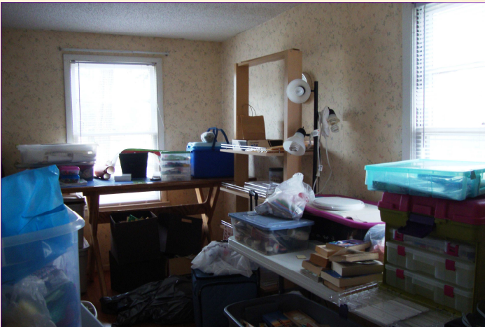
Bedroom presently being used as a Craft Room