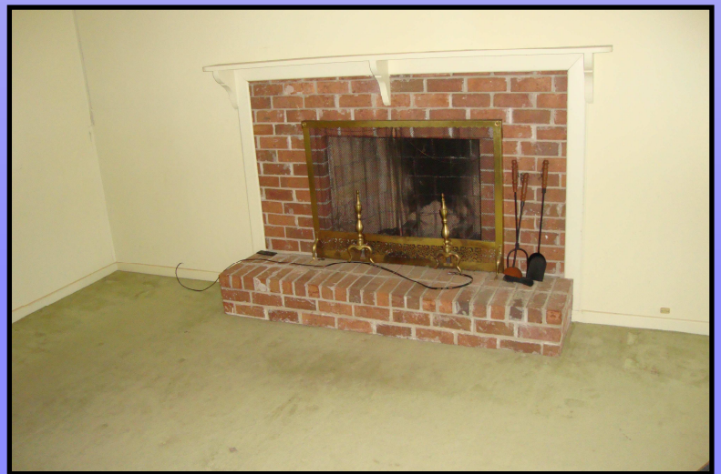
Fireplace in Owner's Bedroom