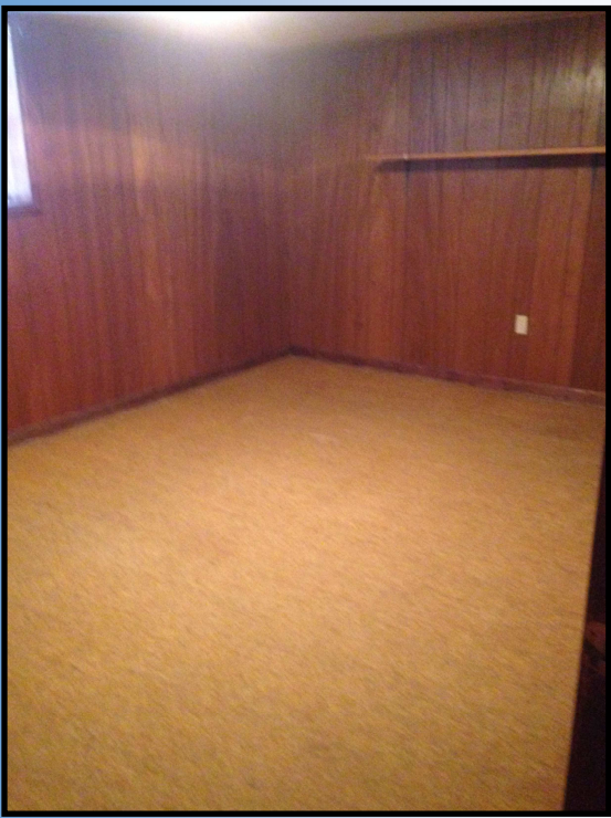
Game Room or 4th Bedroom