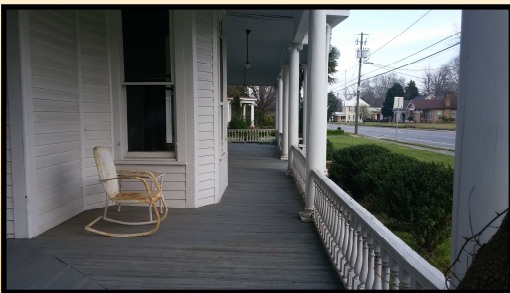
Wrap around Front Porch

DINING ROOM 20' x 18' Heart of pine floors, fireplace and mantel. The brass chandeliers in these two rooms are probably from the 1920's replacing the original gas lights.