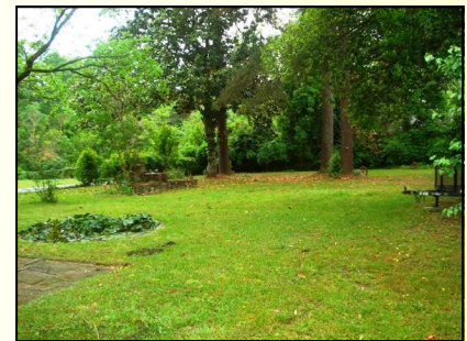
Patio, Gold Fish Pond & BBQ Pit