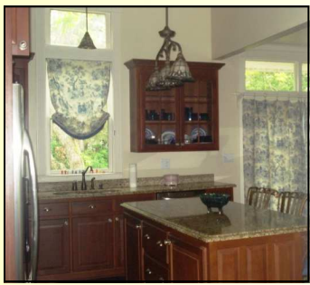
Additional views of Kitchen