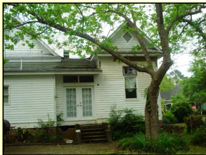
Patio with entry to Kitchen