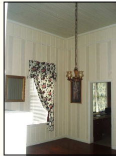
Additional view of Dining Room