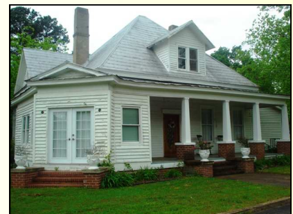
Different view of Home

DIRECTIONS: When traveling west into Warrenton on Main Street turn right onto N. Whitehead Street. House on left just past the stop sign.