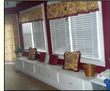
Additional view of Sun Room