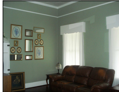
Additional views of Formal Living Room