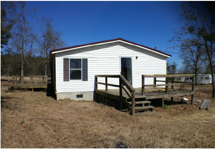
Side of Home