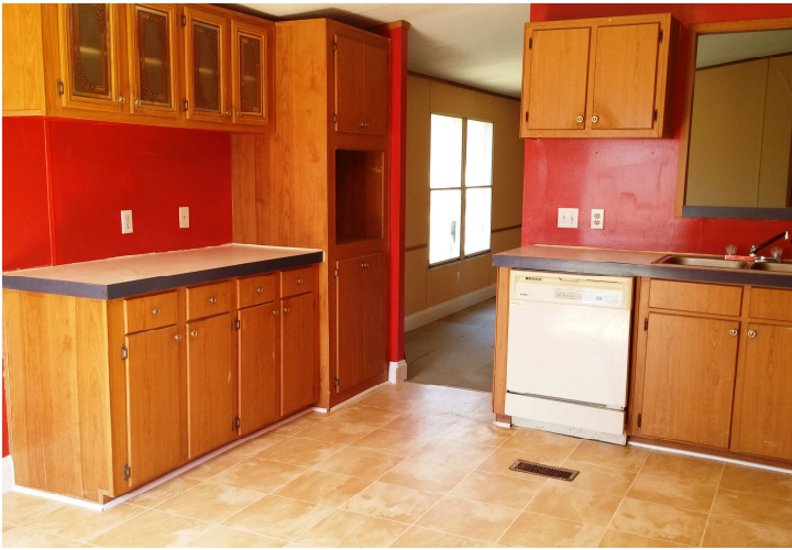
Additional view of Kitchen