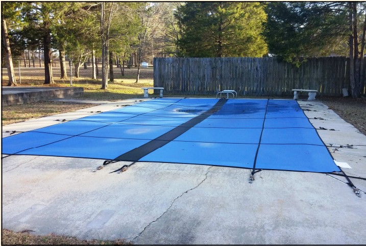
16' x 32' In ground Pool