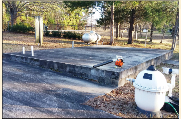
Concrete floor ready for building a Pool House.

(The above data, although believed to be accurate, is not guaranteed by the listing company.)