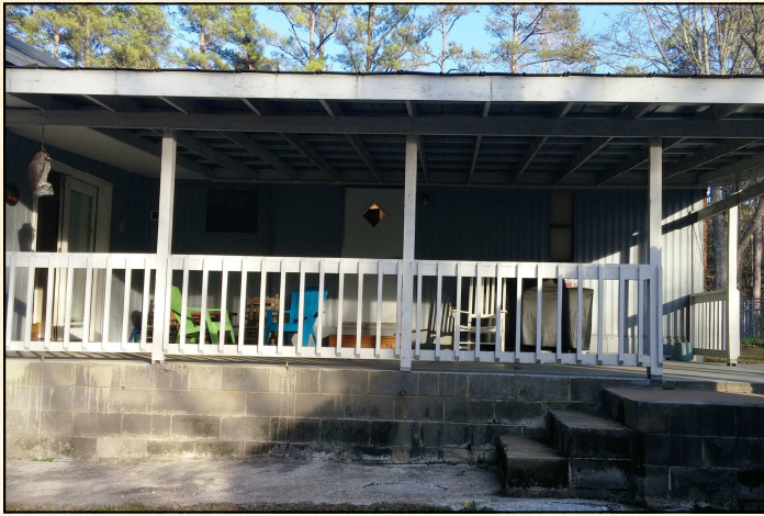
Rear Covered Porch